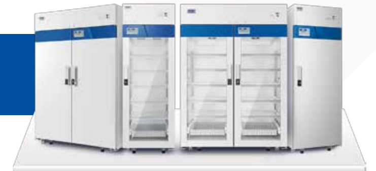
HYC-1099F HYC-509 HYC-1099 HYC-509F

✦ All new appearance Reliable performance