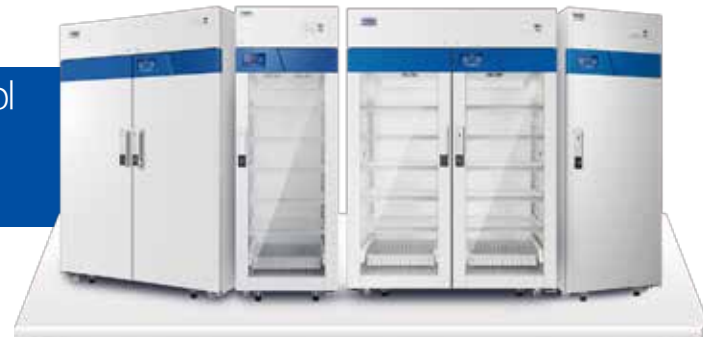
HYC-1099TF HYC-509T HYC-1099T HYC-509TF

✦ Liquid crystal touch screen control Intelligent IoT